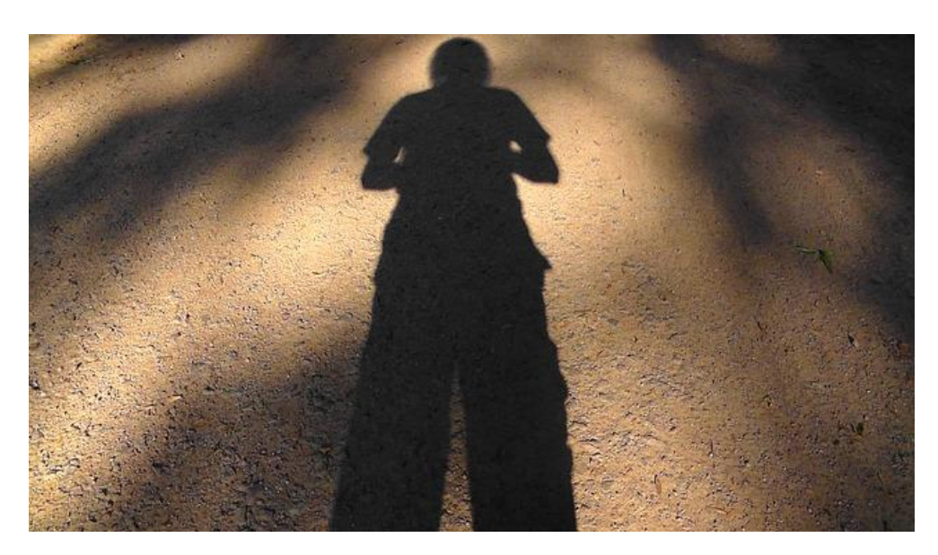
"Shadow Play" photograph from ultrajet.com.

The driver didn't seem to be listening. He looked annoyed, as if he hated driving down that endless road that parted the desert in two. On the left, a reddish, rugged mesa. On the right, gray flatlands littered with stones that reflected varying tones in the sunlight.